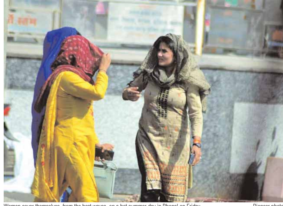
Women cover themselves from the heat waves on a hot summer day in Bhopal on Friday.

Bhopal: State capital witnessed fire at two different on Friday; at 6 in the morning, a big fire broke out in the Udyamita Bhawan located on Jail Hill and after some time fire broke out at a private building in MP Nagar. The fire tender vehicles were pressed into service soon after the fire broke out at these two places which took over 3-4 hours to pacify the fire at these places.